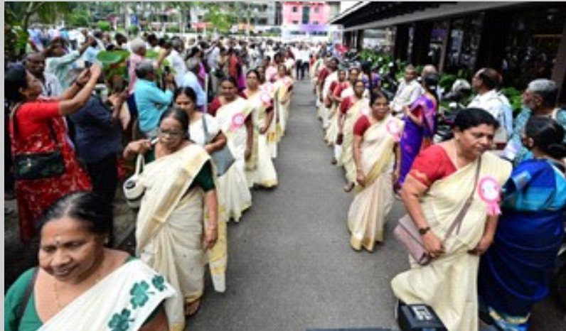
Lady comrades lead the Procession