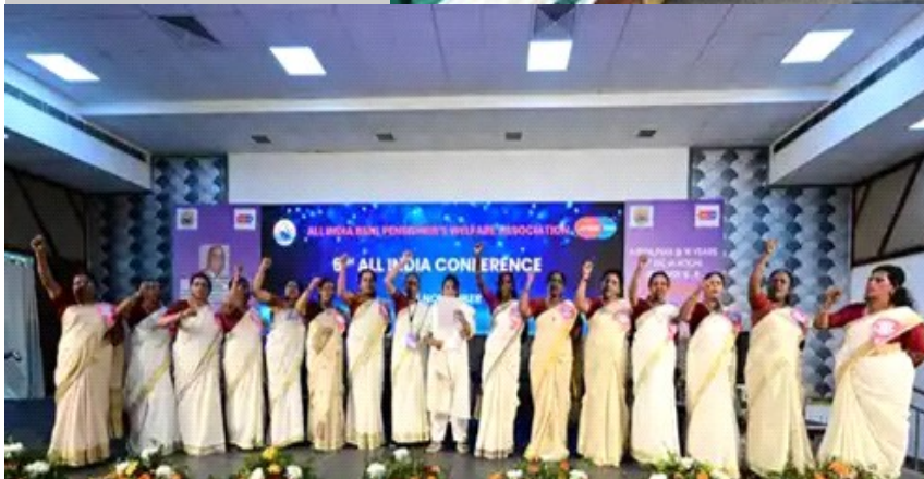
Lady comrades shout slogans