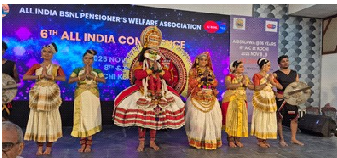
A delightful cultural programme on 8th November 2025